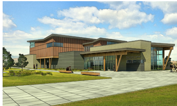
The Curtis Center Project