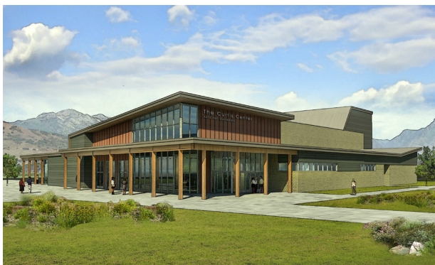
The Curtis Center Project