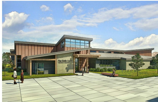
The Curtis Center Project